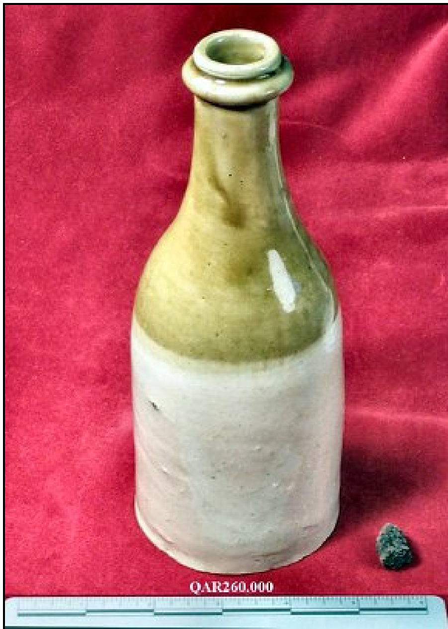
Figure 3: QAR260.000DI00

wheel thrown vessel with poorly defined shoulders and flat bottom similar to the Bertrand Bottle Class 1 Type 1 (Switzer 1974: 9) (Figure 3). It has a rounded lip finish with a single applied coil collar just below the lip. The lower body is white while the shoulder and neck are a pale yellow ochre color. The bottle is stamped in the body near the base with “Price/Bristol” mark that angle slightly downward. The original content was more than likely ale (Switzer 1974: 9- 14). Bottles of this general type were manufactured beginning 1820 and lasted into the twentieth century with a median date of 1860 (South 1970).