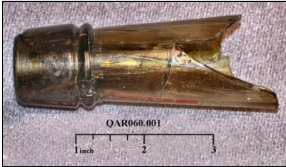
Figure 1: QAR060.001DI002