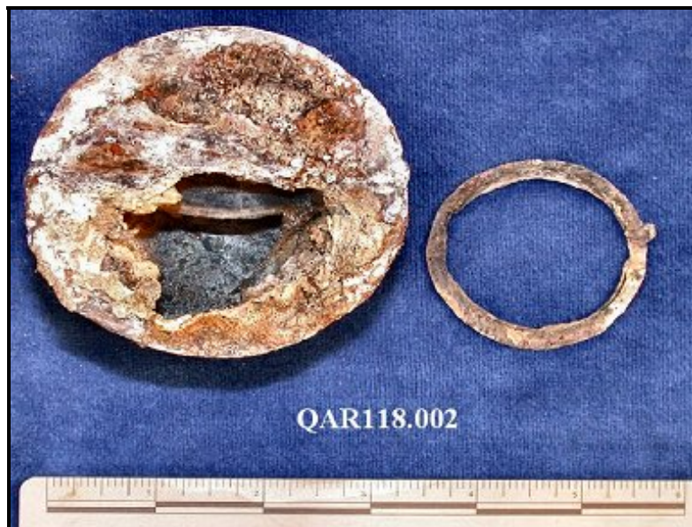
Figure 2: QAR118.002060.001DI002