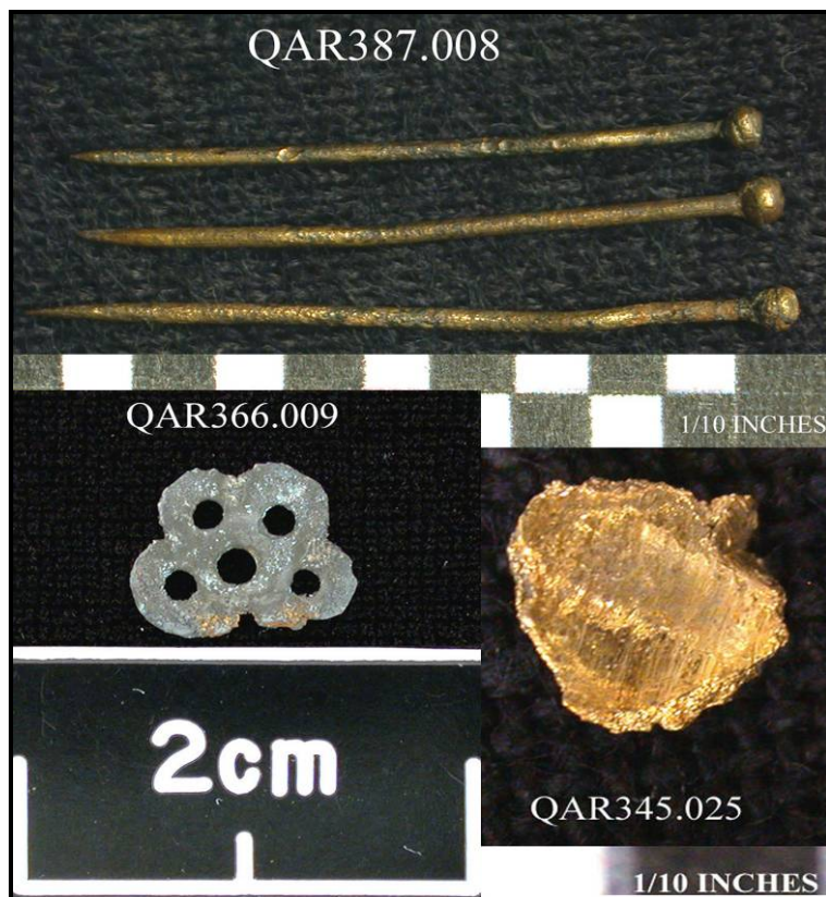
Figure 6: Personal effects including a gold nugget, three brass straight pins, and a gold-plated silver button or spangle.

Personal effects recovered from the shipwreck include a kaolin clay pipe stem fragment (length, three and one-half inches, bore diameter, 0.1 inch), an intact pipe bowl that has yet to be removed from concretion, a brass sail needle, gold dust, a wooden bead, and a gold-plated silver button or spangle (Figure 6). Three brass straight pins (length, one inch) were found within a concretion that