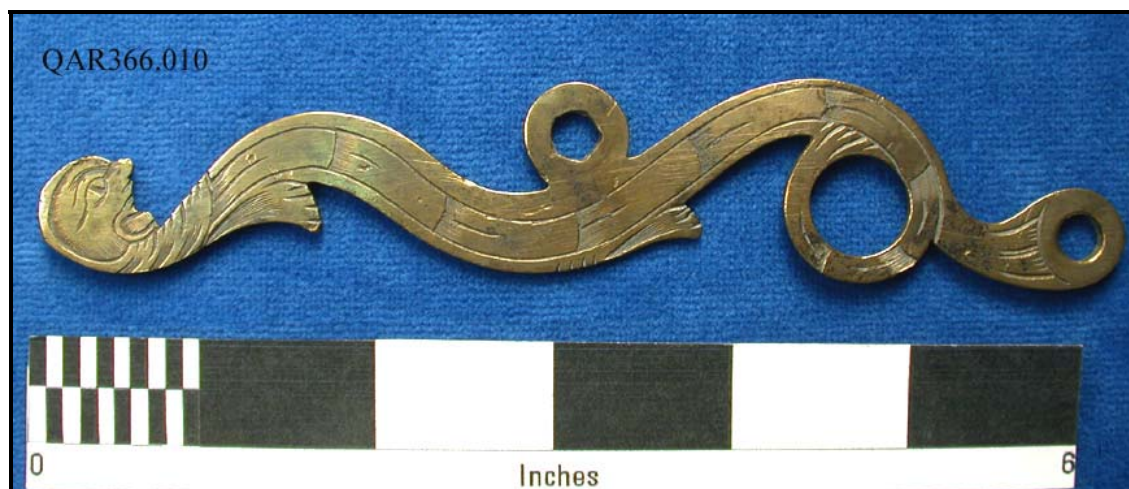
Figure 5: Brass serpentine side plate from a blunderbuss or musket.

1977:16-19). Small arms from the Beaufort Inlet site include a brass blunderbuss barrel with London proof and view marks of the style dating to between 1672-1702 (Hawtrey Gyngell 1959:11), a brass side plate in the form of a sea serpent (Figure 5), and a brass butt plate. A small concretion found in June 1999 appears to be the remains of a small wooden box or container. A slat of wood still