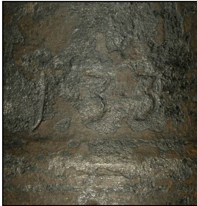
Figure 2: Weight marks on breech of cannon C-21.

One of the two small cannons (C-21) raised in 1999 measures three feet, ten inches in length and features the numbers 1-3-3 (Figure 2) stamped laterally on the breech [1(112) + 3(28) + 3 = 199 lb.].