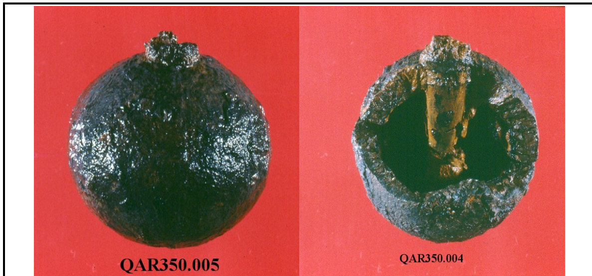
Figure 4: Two cast-iron hand grenades, one with a section removed to reveal the wooden fuse.

Two hand grenades (diameter, three inches) were removed from concretion attached to a pewter charger recovered in 1998. The grenades consist of cast-iron spheres packed with gunpowder and pierced to accept a hollow wooden fuse (Figure 4). The fuse also contained powder and a paper match, and would have been lit and thrown at the enemy with devastating results (Marsden and Lyon