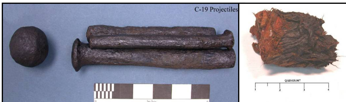
Figure 3: Contents of cannon C-19 included three iron drift pins, a solid round shot and three wads of cordage.

The second small cannon (C-19) is four feet, six inches in length. Its right trunnion was cast with the letters IEC representing the foundry of Jasper Ehrencreutz, operating in Sweden from 1695-1743 (Kennard 1986:70; Peterson 1973:156-157). The left trunnion is dated [1]713. After removal of the wooden tompions, the gun was found to contain a wad of cordage followed by three iron drift pins, a second wad, a solid round shot, a third wad, and the powder charge (Figure 3). Both of these smaller guns appear to be typical carriage-mounted cannons, not rail-mounted swivel guns.