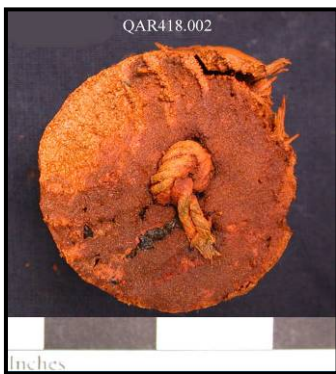
Figure 8: Intact wooden tompons scalpels.

primarily consisting of ballast stones, a clap pipe bowl and stem sections, and some unidentifiable wood fragments, were removed prior to the start of the unloading process. Although very fragile and eroded flush with the ends of the muzzles, the tompons in both of the cannons were found to be intact (Figure 8). A surgical scalpel inserted between the wooden plug and metal barrel of C-19 effectively broke the concretion bonding the differing materials. Extraction of the now loosened tompons in one piece presented more of a challenge. The tompons (Diameter, one and one-eighth inches, depth, one and seven-eighth inches) was centrally pierced and the remains of a knotted cord were too friable to pull, so a series of scalpels were inserted around the circumference of the tompons, squeezed gently together, and withdrawn, thus removing the plug intact (Figure 9).