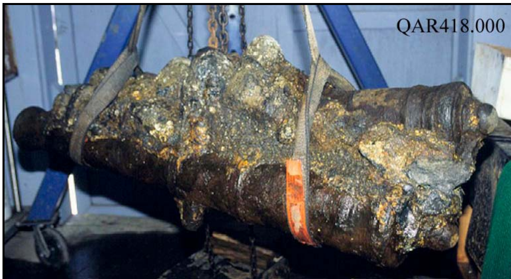
Figure 1: Two small cast-iron cannons during removal of concretion and associated ballast stones.

In June and October 1999, archaeologists from the State of North Carolina conducted a diver-positioned magnetometer survey of the Beaufort Inlet site. Numerous ferrous objects including another cannon were detected in the surrounding sediments. A large ballast-covered concretion located adjacent to the structural remains was recovered, and when opened in the laboratory, revealed two additional cannons (Figure 1). Miscellaneous small artifacts such as stoneware fragments, a pewter charger, ballast stones, and a wooden hull plank recently disturbed by hurricane conditions were recovered for conservation and analysis. Field and laboratory personnel also assisted with the production of a British Broadcasting corporation documentary featuring the project.